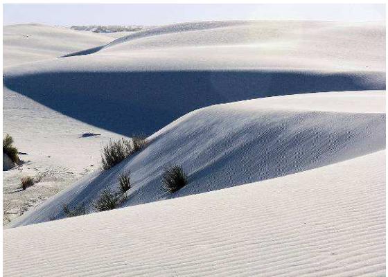
White Sands National Monument