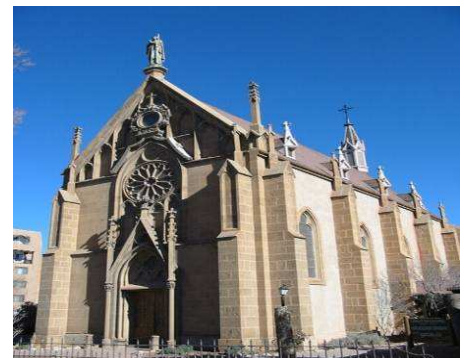
Loretto Chapel - Santa Fe