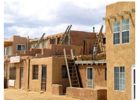
Acoma “Sky City” Pueblo

Onto Albuquerque for the International Hot Air Balloon Festival, featuring a gorgeous gas glow illuminating the evening sky from more than 800 colorful hot air balloons. Take in the morning spectacle of the world’s largest mass ascension. Your next stop includes a guided tour of Acoma “Sky City” Indian Pueblo, a mesa-topped fortress, and free time to shop or explore the Old Town or San Felipe Church. Conclude the tour with a ride on the world’s largest aerial tram to Sandia Peak, with breathtaking views from 10,378 feet high.