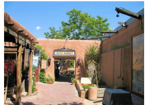
Old Town - Albuquerque