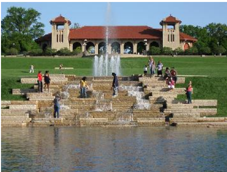
Performance at “The Muny”

Featuring 20 larger than life lanterns at the Missouri Botanical Garden and a performance at “The Muny” with backstage tour