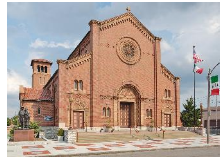
St. Ambrose Church “The Hill”