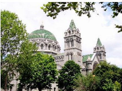
St. Louis Cathedral Basilica

But that’s not all...enjoy a tour of The Hill, a traditional Italian-American neighborhood. The tour will provide you with an opportunity to learn and experience why this beloved neighborhood remains a special place to visit and enjoy. Besides the obvious well-known restaurants, bakeries and Italian food markets, the Hill has many other aspects that will educate, charm and delight you.