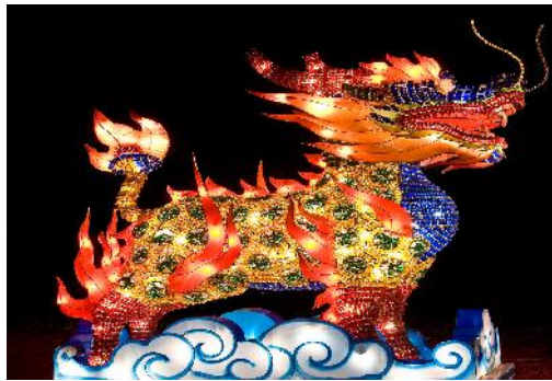
Chinese Lantern Festival