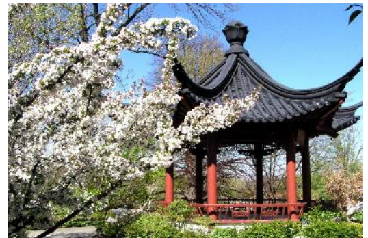
Missouri Botanical Garden Tram Tour

The Missouri Botanical Garden is hosting one of China’s most treasured events and ancient traditions – a lantern festival! More than 20 larger than life lanterns have been custom-designed and crafted from silk and steel. The exhibition is the first of its kind and size in the United State and offers a unique opportunity to witness a spectacle that’s rarely staged outside of Asia.