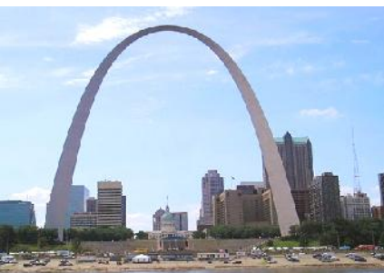
Jefferson National Expansion Memorial